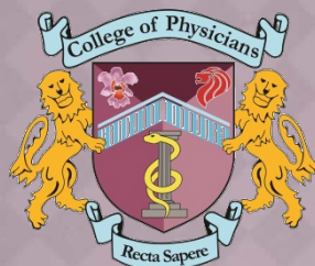
Chapter of Endocrinologists College of Physicians, Singapore