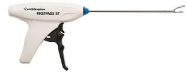
FIRSTPASS Rotator Cuff