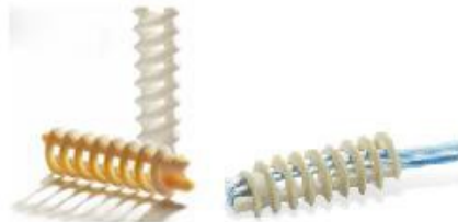
HEALICOIL™ PK Rotator Cuff