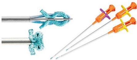
SUTUREFIX ULTRA All Suture Instability