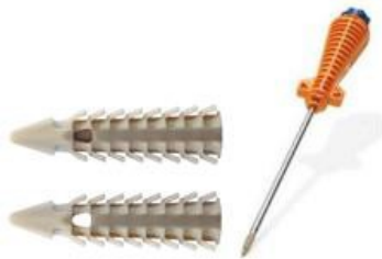
FOOTPRINT™ ULTRA PK Rotator Cuff

The full range of S&N's shoulder arthroscopy products will be available during this course.