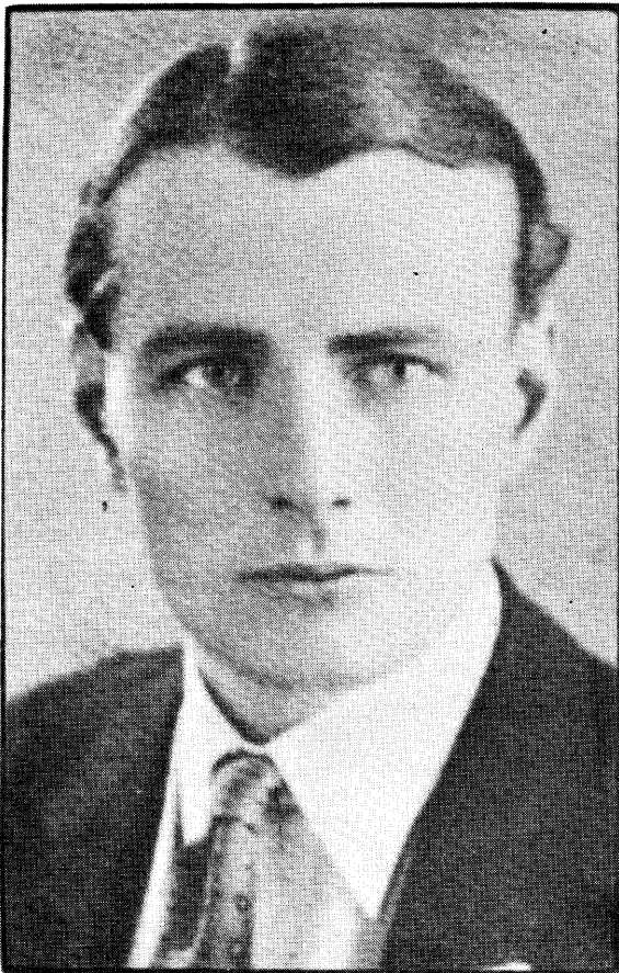
The young handsome professor . . . 1938.